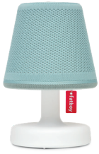
Edison the Petit Hoodie